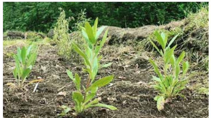
A new pollinator garden is sprouting on vacant MSD owned land in the Beechmont area. The land must remain undeveloped due to the infrastructure far underground.

Another MSD owned parcel of vacant land—where deep below the surface is a large sewer interceptor pipe—is now home to a pollinator garden in the Beechmont Neighborhood. In May, the Jefferson County Soil and Water Conservation District, in partnership with the Beechmont Neighborhood Association, kicked off the installation of the garden bringing new life to the third-of-an-acre property. The two groups have agreed to maintain the property.