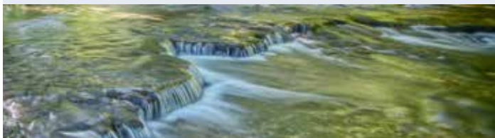
Middle Fork Beargrass Creek