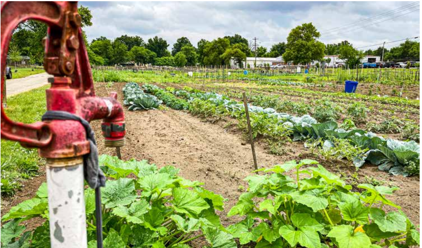
The six-acre Seventh Street Community Garden sits on MSD owned land, which can never be developed in the traditional sense due to vital infrastructure deep below the surface.