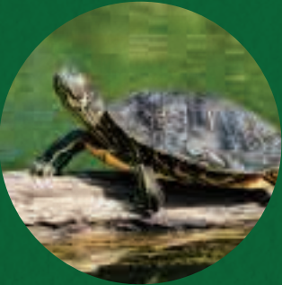
Pond Slider Turtle