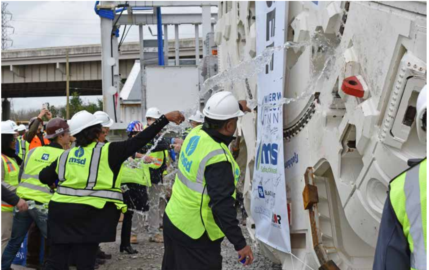
Attendees “christen” the cutterhead with bottles of Louisville Water’s pure tap®.