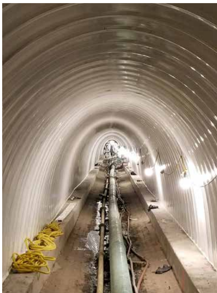
New PVC panels line the interior of a large sewer line under Main Street between Fourth and Seventh streets.

For more information on MSD’s West Main Repair visit http://louisvillemsd.org/westmainrepair .